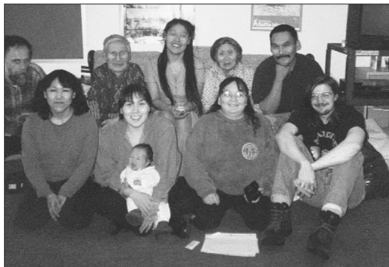
Group photo of students at the end of the course.

"We were still living in igluit when I was growing up. The priests never came where we were living. We went to Igluligaarjuk once around Easter time. After that we returned to where we were living. This was shortly before our father died. There were four or five priests in Igluligaarjuk. My father was baptised there. There were no qallunaat where we were living. We never had any priests or ministers come to us. It was always us who would go where there was a priest."